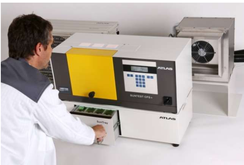
Figure 3: In vitro UVA test setup with SUNTEST CPS+, SunCool and SunTray accessories

The test temperature between 25-35 °C are controlled even at highest SUNTEST irradiance settings by a refrigeration unit called SunCool which feeds in chilled air. To complete the ideal test setup, there is a specimen handling accessory named SunTray (Figure 3). The SunTray is a sample exchanger unit underneath the SUNTEST and includes a holder for 8 standard PMMA plates. It allows for fast and safe exchanging of samples during the SUNTEST in continuous light mode. It's both practical and the continuous light mode takes care of the SUNTEST xenon lamp which would suffer from frequent ON/OFF switches caused by short UVA test durations of a few minutes.