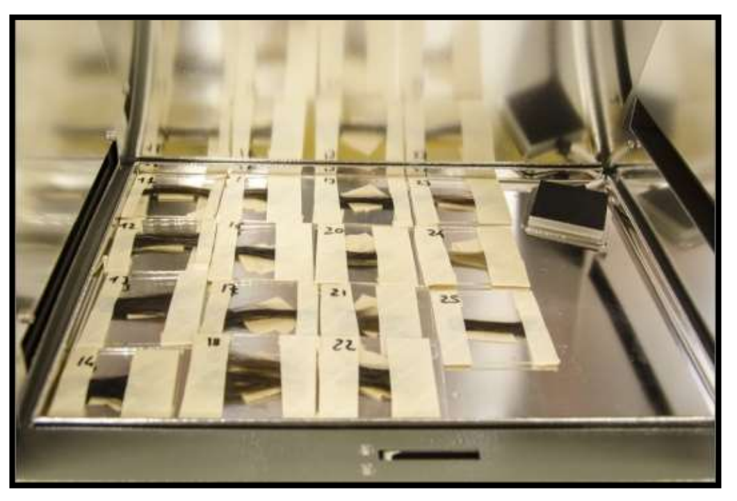
Figure 1. Hair samples positioned for radiation exposure inside SUNTEST CPS+

xenobiotics can gradually disappear from the hair shaft or be transformed into other compounds having different structure from the parent molecule. Thus, light exposure should considered he as а potential confounder in studies investigating xenobiotics in hair giving to reduced rise drug concentrations or even false negative results. On other the hand, the formation of new photodegradation products could lead to the identifycation of new markers of abuse useful in forensic evaluations.